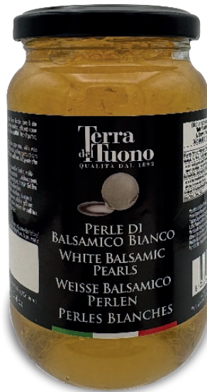
White Balsamic Pearls 380 g - 13.4 oz