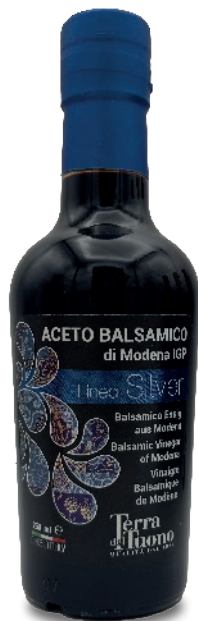
Silver Line Balsamic Vinegar of Modena Density 1,25 250ml - 8.45 fl.oz