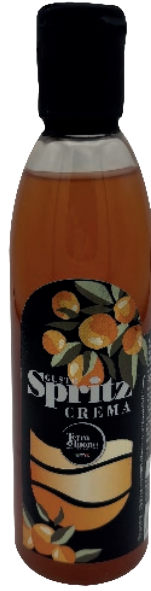
Spritz Glaze 250 ml - 8.45 fl.oz

Pairings: Grilled bruschetta Fish and vegetable couscous Zucchini salad Aubergine flan Roasted cauliflower