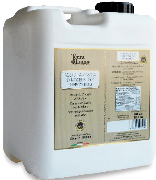
5000 ml - 169.1 fl.oz

Aged Balsamic Vinegar of Modena - Density 1,34 Gold Line Balsamic Vinegar of Modena - Density 1,30 Silver Line Balsamic Vinegar of Modena - Density 1,25 Azure Line Balsamic Vinegar of Modena - Density 1,19 White Balsamic Condiment - Density 1,21