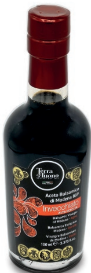
Aged Balsamic Vinegar of Modena Density 1,34 100 ml - 3.375 fl.oz