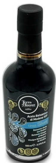
Silver Line Balsamic Vinegar of Modena Density 1,25 100 ml - 3.375 fl.oz