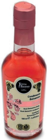
Rosé Balsamic Condiment Density 1,20