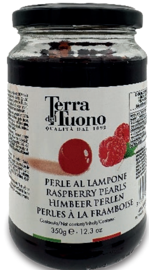
Raspberry Pearls 350 g - 12.3 oz