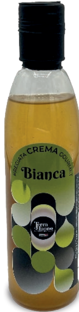
Glaze with White Balsamic 250 ml - 8.45 fl.oz

Pairings: Salad, Caprese, Hamburgers, Salmon fillet, Meat skewers