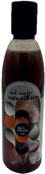
Smoked Salt Glaze 250 ml - 8.45 fl.oz

Pairings: Beef ribs Grilled octopus Eggplant Mushroom tacos Cheeses