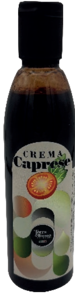
Caprese Glaze 250 ml - 8.45 fl.oz

Pairings: Beef ribs Grilled octopus Eggplant Mushroom tacos Cheeses