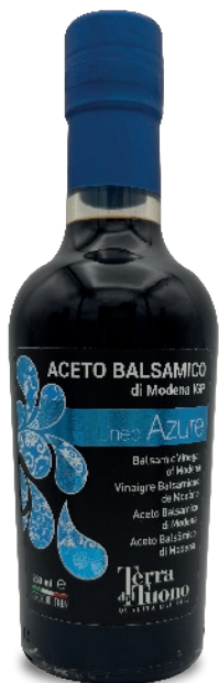
Azule Line Balsamic Vinegar of Modena Density 1,19 250 ml - 8.45 fl.oz

Only two ingredients: cooked grape must and wine vinegar. No colourings or caramel.