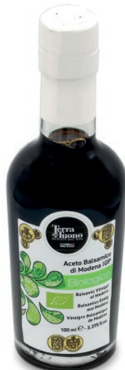
Organic Balsamic Vinegar of Modena Density 1,20 100 ml - 3.375 fl.oz