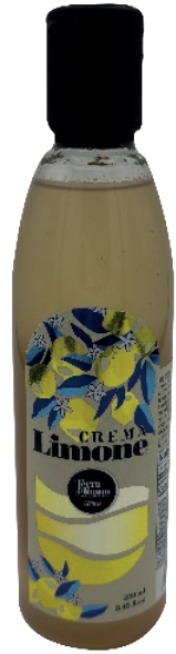
Lemon Glaze 250 ml - 8.45 fl.oz

Pairings: Crispy Salt cod Pecorino cheese Duck breast Fennel and olive salad Fiordilatte ice cream