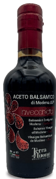
Invecchiato - Aged Balsamic Vinegar of Modena Density 1,34 250 ml - 8.45 fl.oz