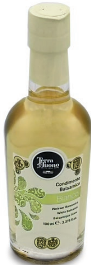
White Balsamic Condiment from white grapes Density 1,21