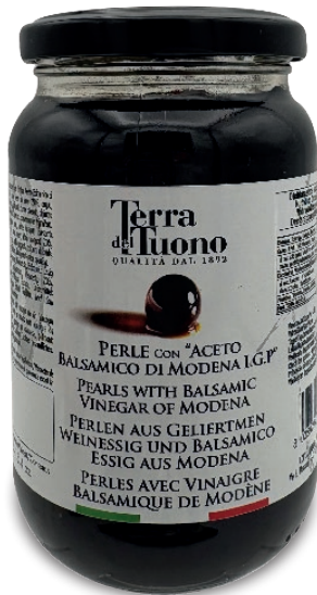
Pearls with Balsamic Vinegar of Modena 380 g - 13.4 oz

Our Pearls - Horeca size Soft spheres with a liquid drop inside