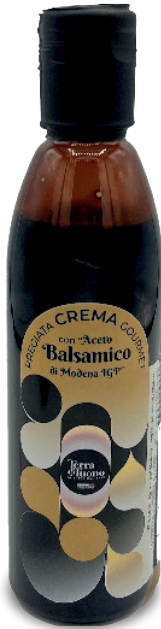
Glaze with Balsamic Vinegar of Modena 250 ml - 8.45 fl.oz

Ready to use, our Balsamic Glazes are free from any added sugars, colourings, caramel and gluten, and are perfect for elegantly garnishing and decorating any dish.