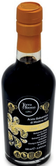
Gold Line Balsamic Vinegar of Modena Density 1,30 100 ml - 3.375 fl.oz