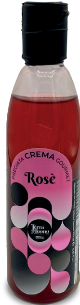
Glaze with Rosé Balsamic 250 ml - 8.45 fl.oz

Pairings: Swordfish Carpaccio, Asparagus, Crispy Lemon Chicken Cutlet, Chocolate Mousse