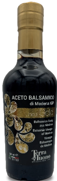
Gold Line Balsamic Vinegar of Modena Density 1,30 250 ml - 8.45 fl.oz