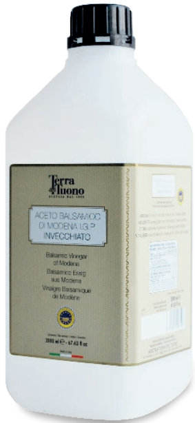
2000 ml - 67.63 fl.oz