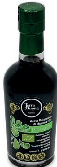
Organic Balsamic Vinegar of Modena Density 1,30 100 ml - 3.375 fl.oz